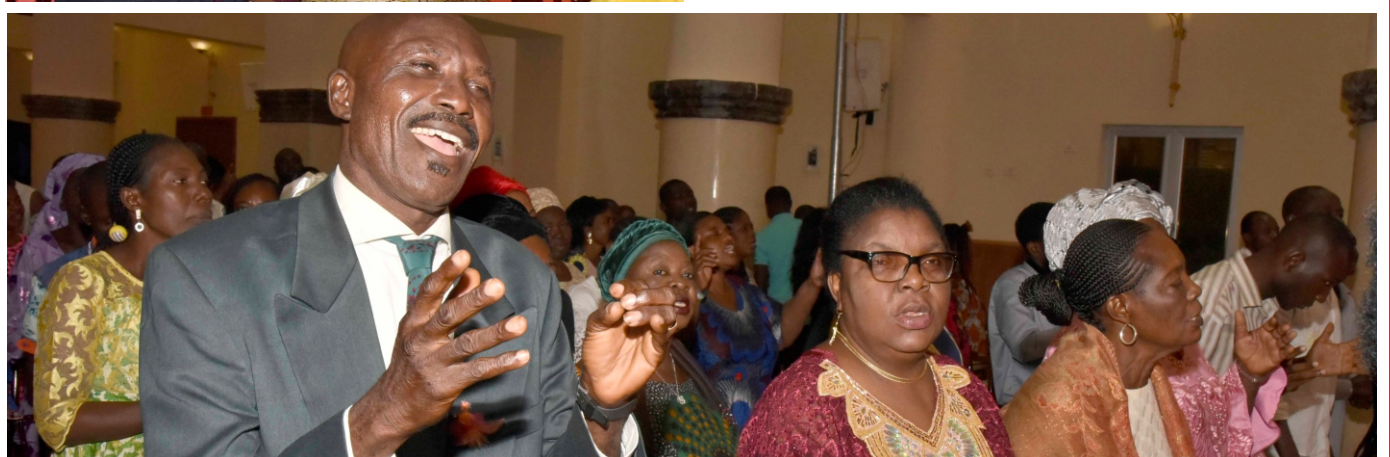
Cross-section of participants