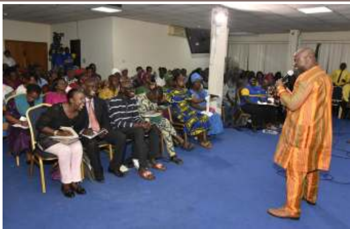
Celebrating our dear Servant Leader at 68