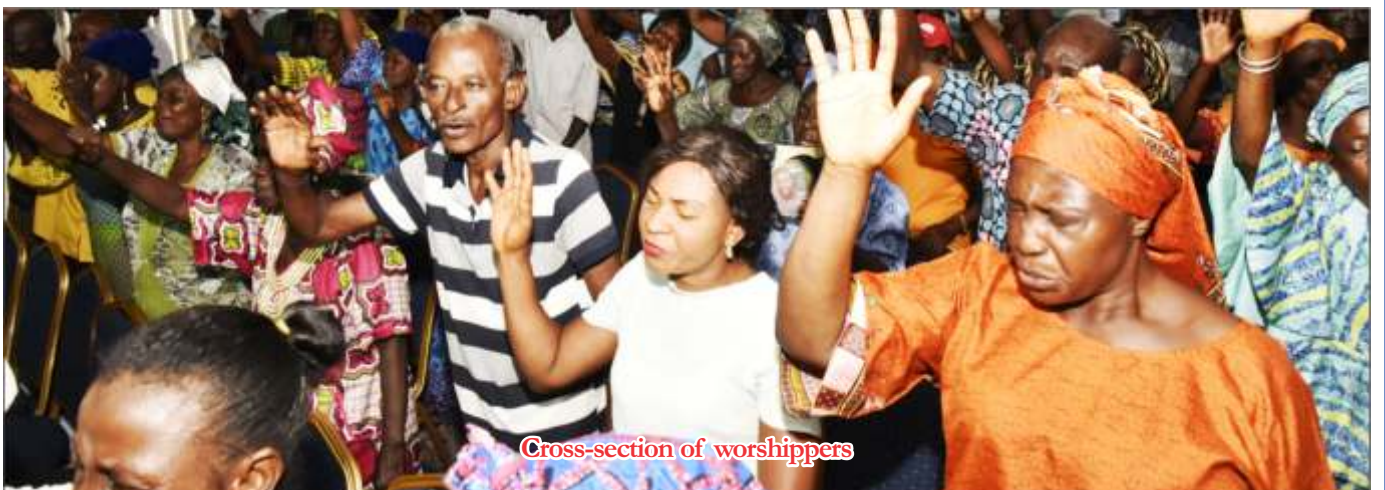
Cross-section of worshippers