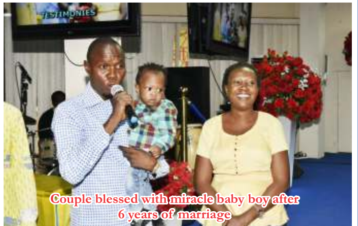
Couple blessed with miracle baby boy after 6 years of marriage