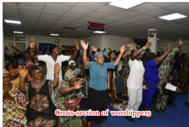
Cross-section of worshippers