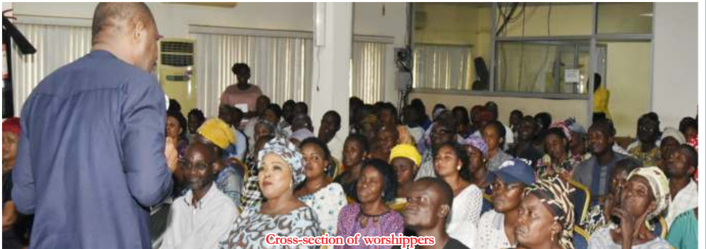
Cross-section of worshippers