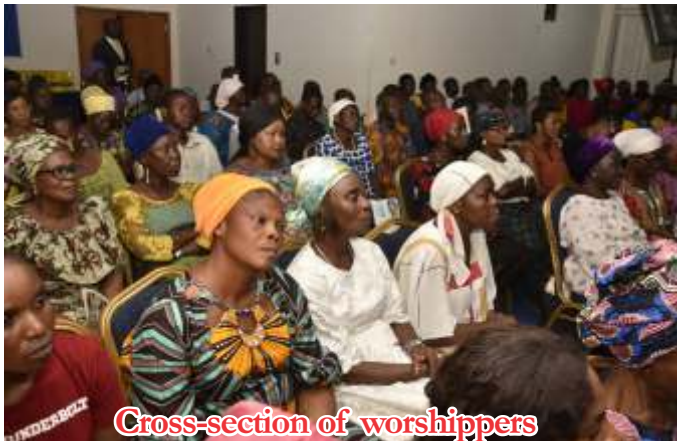
Cross-section of worshippers