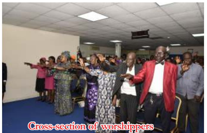
Cross-section of worshippers