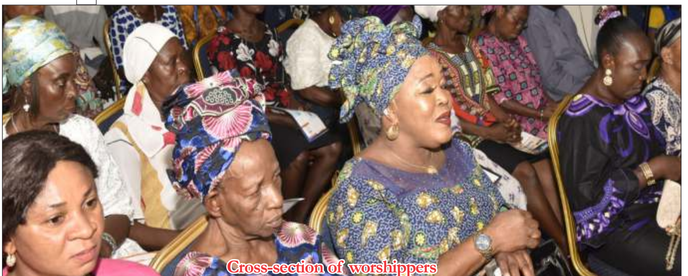
Cross-section of worshippers