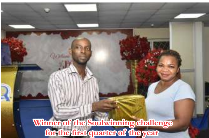
Winner of the Soulwinning challenge for the first quarter of the year