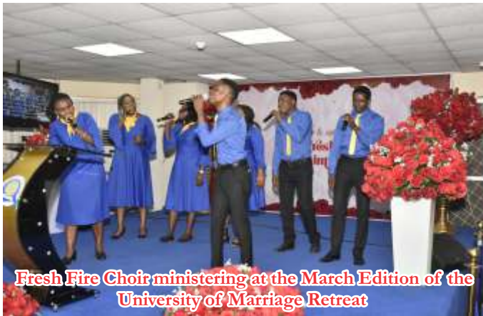
Fresh Fire Choir ministering at the March Edition of the University of Marriage Retreat