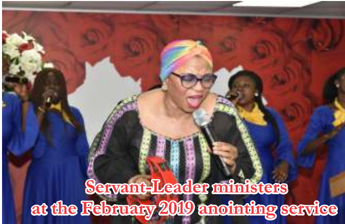
Servant-Leader ministers at the February 2019 anointing service