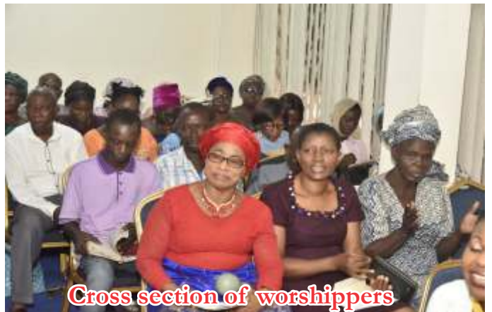
Cross section of worshippers