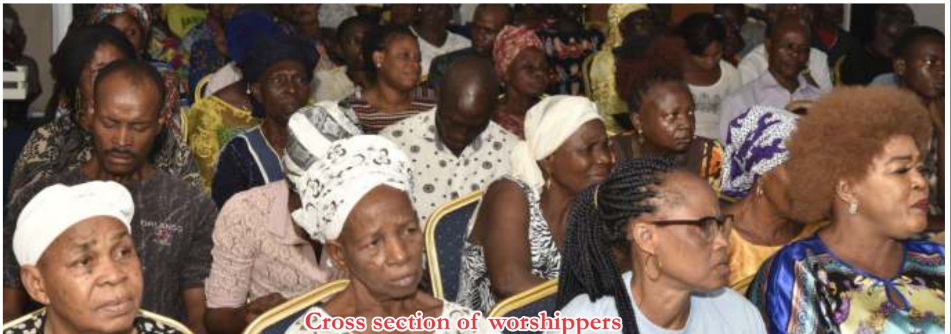
Cross section of worshippers