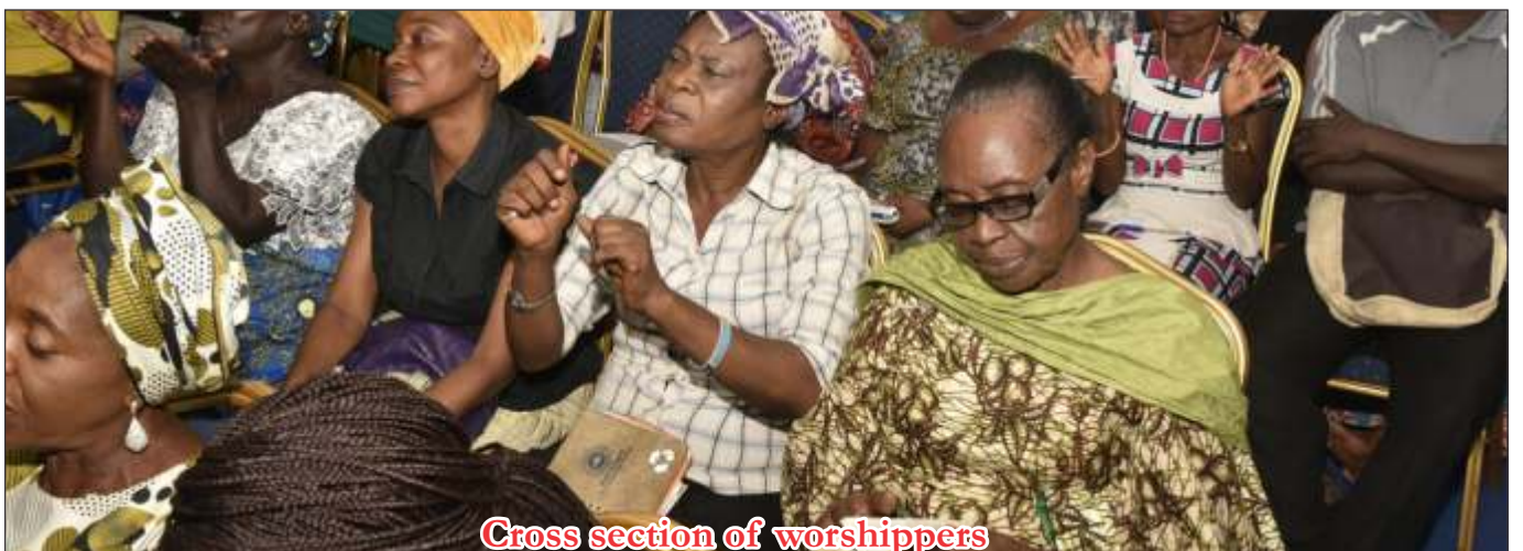
Cross section of worshippers